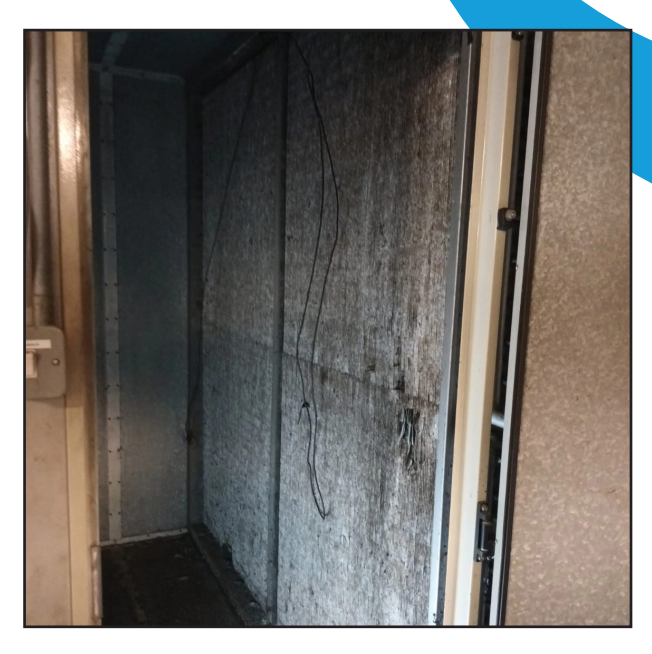
New coil, filter frames and corrosion treatment completed