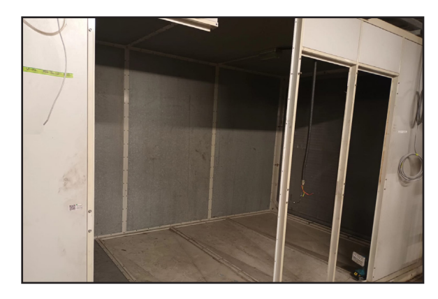
EC Fan Upgrade